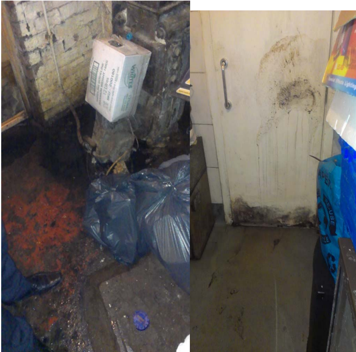
3) Waste accumulation and further filth in cellar areas.